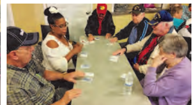
Members enjoyed Bingo and Casino games at the Popcorn Festival "Senior Stop"