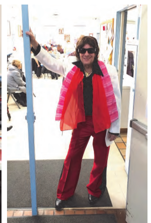
Our Center choir "Seniors in Song" recently traveled to Lexington Senior Center to perform a concert for their members and guests. Our choir members received rave reviews and were also treated to a delicious lunch from the Lexington Center.