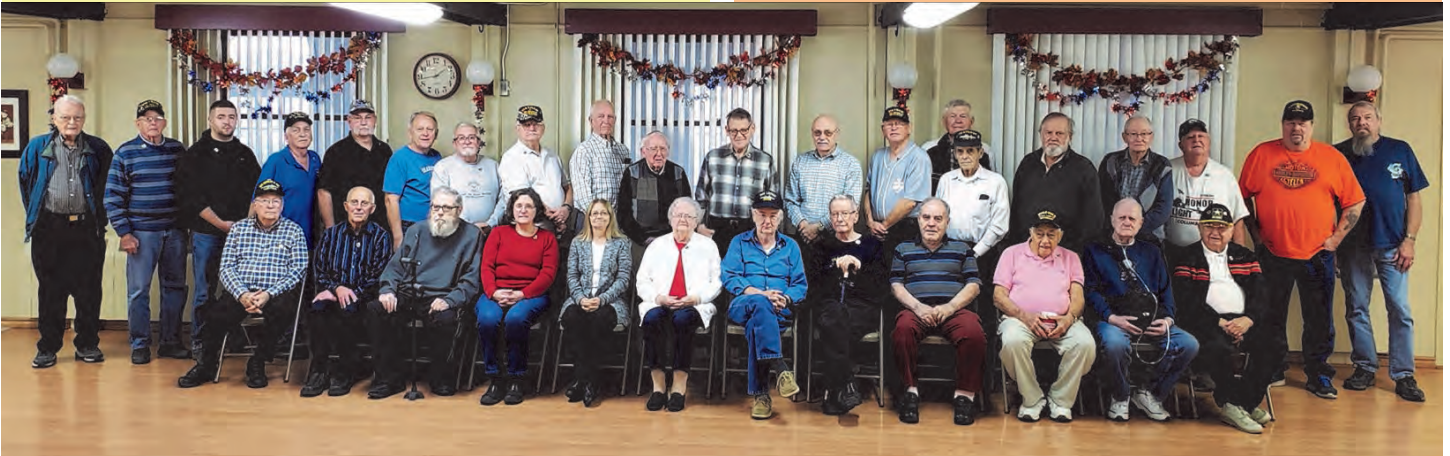
We honored 33 veterans in attendance at our Veterans Day Celebration on Friday, November 9. We thank our sponsor Kindred.