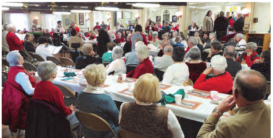
Over 230 members and guests enjoyed our annual Christmas Dinner, which featured our choir "Seniors in Song" performing a variety of traditional carols.