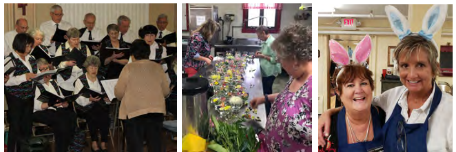
220 members & guests enjoyed a delicious Easter Dinner and a beautiful, inspiring performance by our "Seniors in Song" (and surprise guest, "Will Rogers").