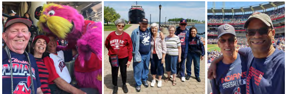
We had perfect weather - and a full bus - for our trip to the Indians vs. Reds game.