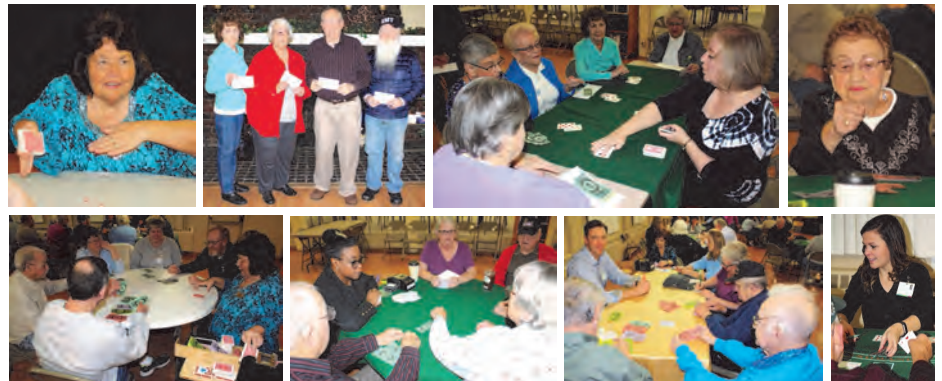
Members were "all-in" on Vegas Day fun! Special thanks to sponsor Kingston.