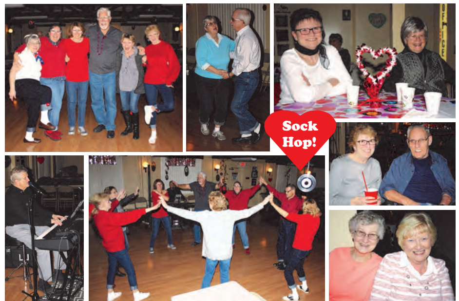
50 members attended our evening Sock Hop! Special thanks to sponsor Primrose.