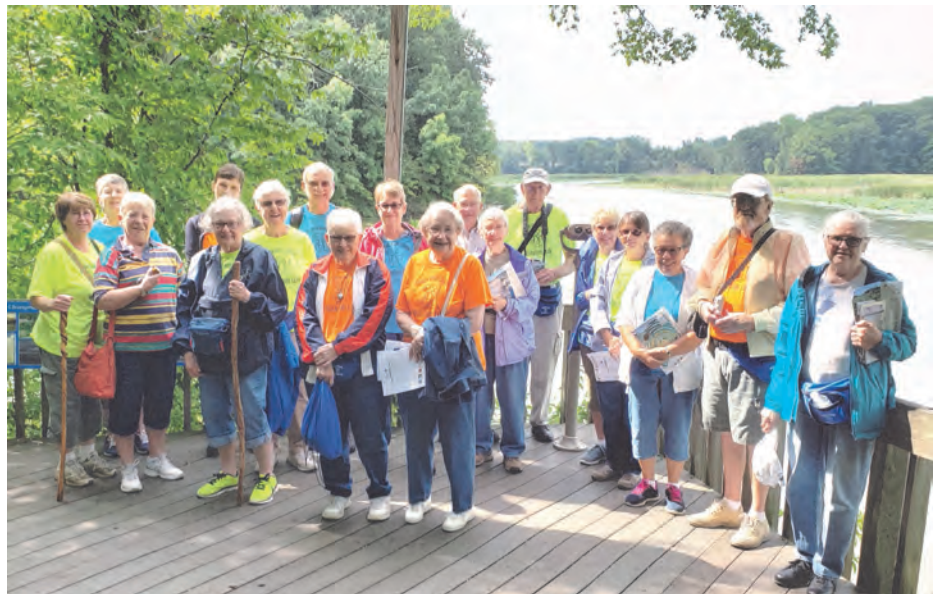
Adventure Club enjoyed their final trip of the year to Old Woman Creek in Huron, OH