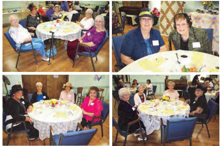
More photos from the Fancy Tea Party! To view a complete photo gallery visit: www.Facebook.com/MarionSeniorCenter