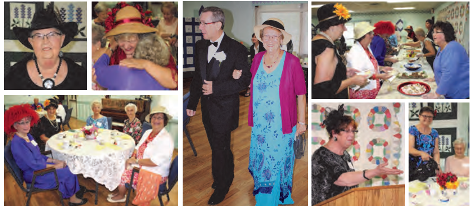
Everyone loved the Fancy Tea Party. See the photo gallery on our Facebook page!