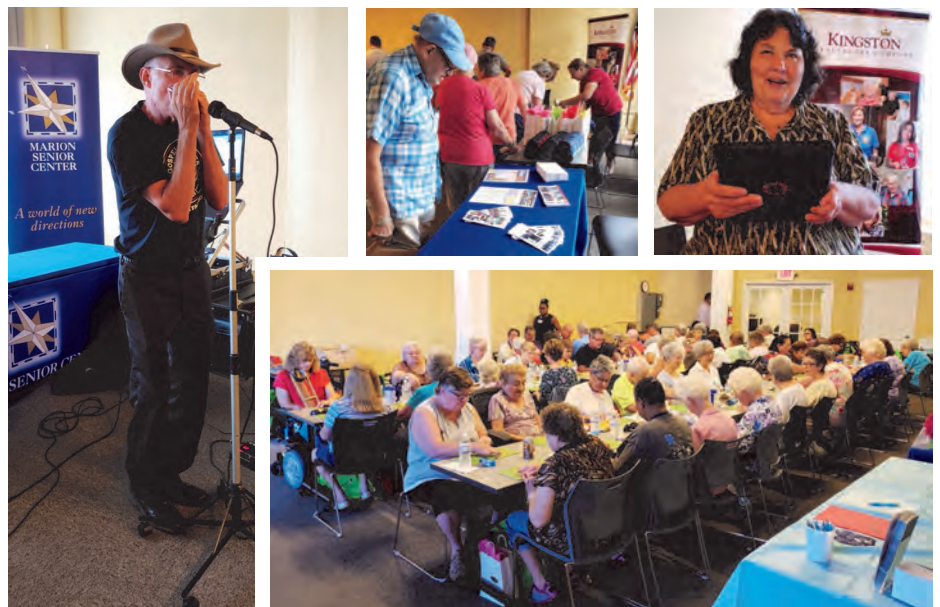
Popcorn Festival 'Senior Stop' featured Bingo, Casino Games & Harmonica Man